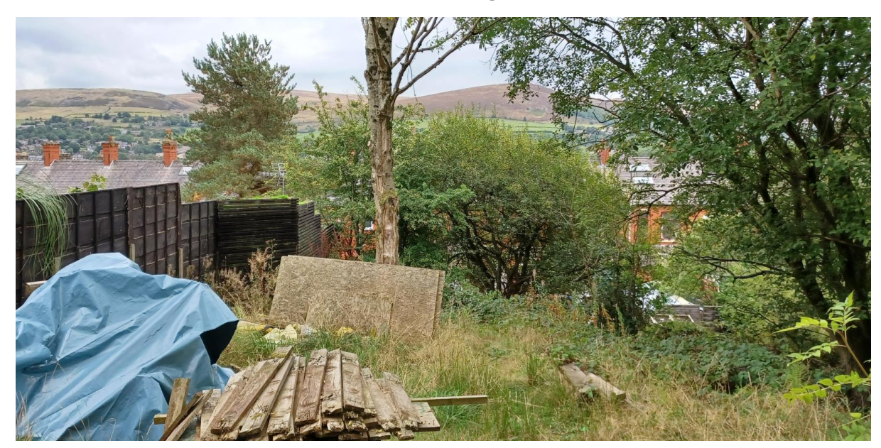
Photo 5: View from the end of Stableford looking towards Andrew Street